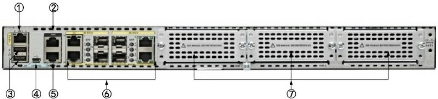
Figure 3 shows the back panel of Cisco ISR4431/K9.